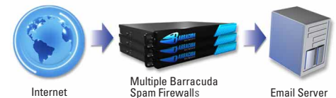
Clustering provides for redundancy and greater capacity